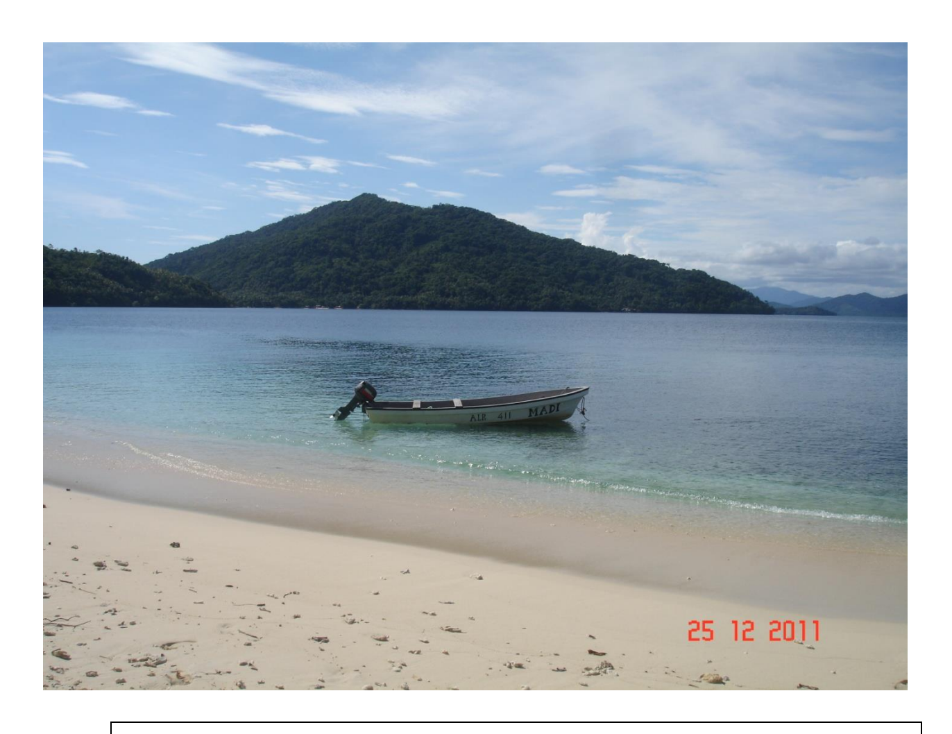
The beach of Deka Deka island with the islands of Doini, Logia and Samarai nearby