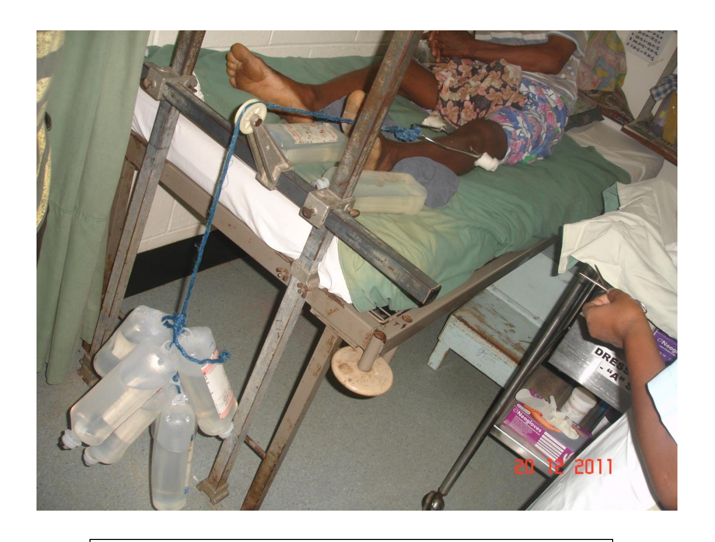
A man with fractured femur having traction using IV bottles for weights